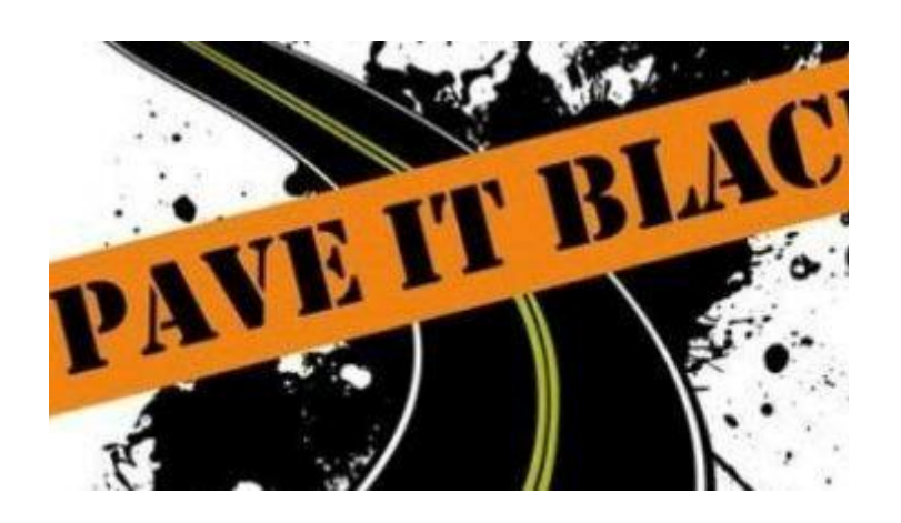
Pave It Black Podcast>>

Join us in celebrating these exceptional women who are shaping the future of asphalt!